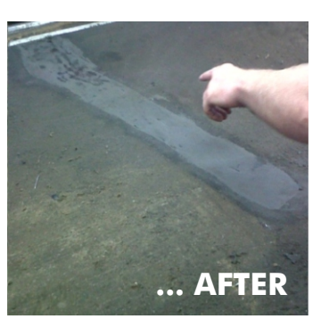
Permanently repair longitudinal cuts, holes, tears, delaminations and clip damage